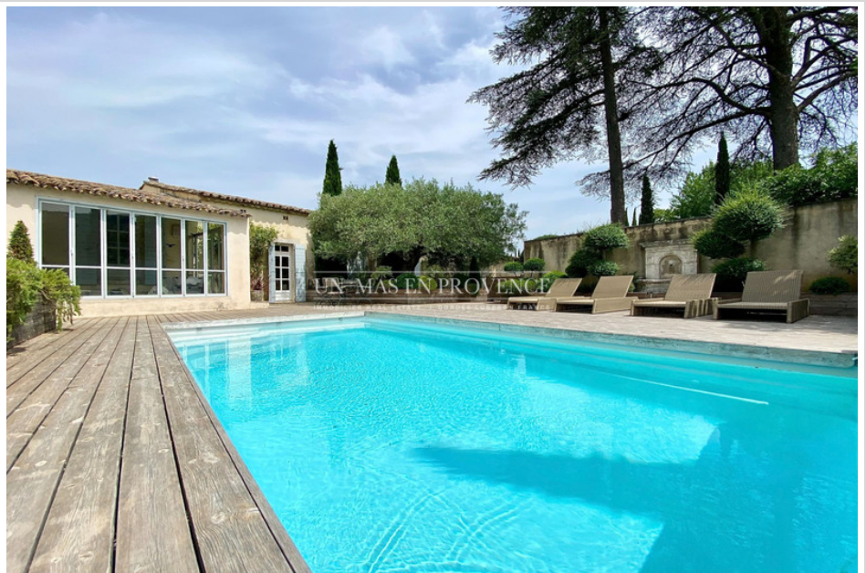
Villa Ref. : L2034M Oppède

Document non contractuel 10/05/2024 - Prix T.T.C